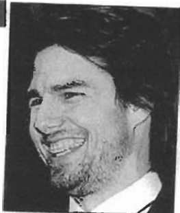
TOP TEETH: Cruise with his brace

treatment. About 50% of my patients are now adults."