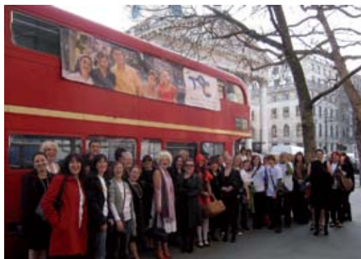
The therapists tour London in style!