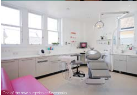
One of the new surgeries at Sevenoaks