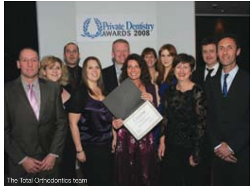
The Total Orthodontics team

We competed against top dental practices from around the UK and were delighted to come away as first runner up and the highest placed orthodontic practice in the best specialist referral practice category. Fingers crossed that next time we come away with 1st prize!