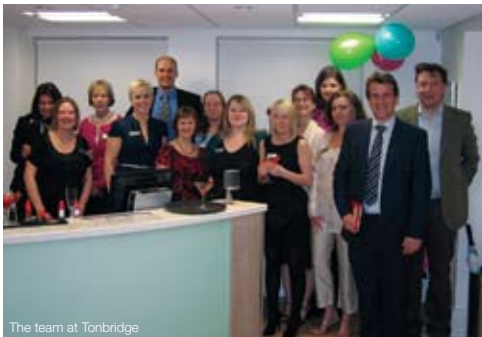
The team at Tonbridge